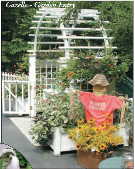
Gazelle - Garden Entry