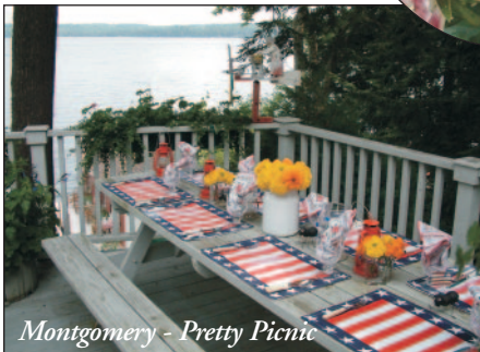
Montgomery - Pretty Picnic

Once again, the Tour is possible because of the generous financial sponsorship of our Community Partners; and the time and talent of special volunteer friends. We are most indebted to and appreciative of the homeowners who graciously accepted the invitation and challenge to share their gardens.