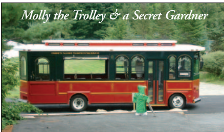
Molly the Trolley & a Secret Gardner